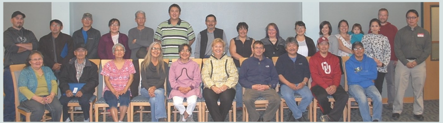
Rights, Resilience, and Community-Based Adaptation Workshop Participants

The rapidly changing climate in the Arctic is creating a humanitarian crisis for indigenous communities in Alaska. In order for Alaska Native communities to implement effective adaptation plans, they need to have access to tools and resources to consistently monitor and document how flooding and erosion impacts their communities. While millions of dollars have been spent on flood and erosion relief (seawalls), these measures are no longer sufficient. Alaska Native villages that decide to relocate to safer land bases, soon realize that state and national government agencies and their policies are inadequate to assist successful community-led relocations. A new relocation governance framework, which guides government institutions on how to relocate a community based on human rights is critical. A community-based social-ecological monitoring and assessment process, designed with Alaska Native coastal communities and technical experts can be a critical part of this governance framework to build adaptive capacity and collaboration between diverse institutions.